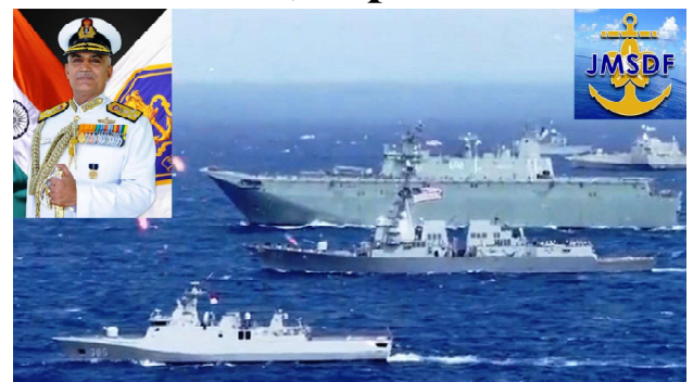
Chief of the Naval Staff Admiral R Hari Kumar is attending the IFR being held at Yokosuka, Japan. A representative image.

In addition to representing India and the Indian Navy during the IFR and WPNS, he will also be in attendance for the inauguration of the 2022 edition of